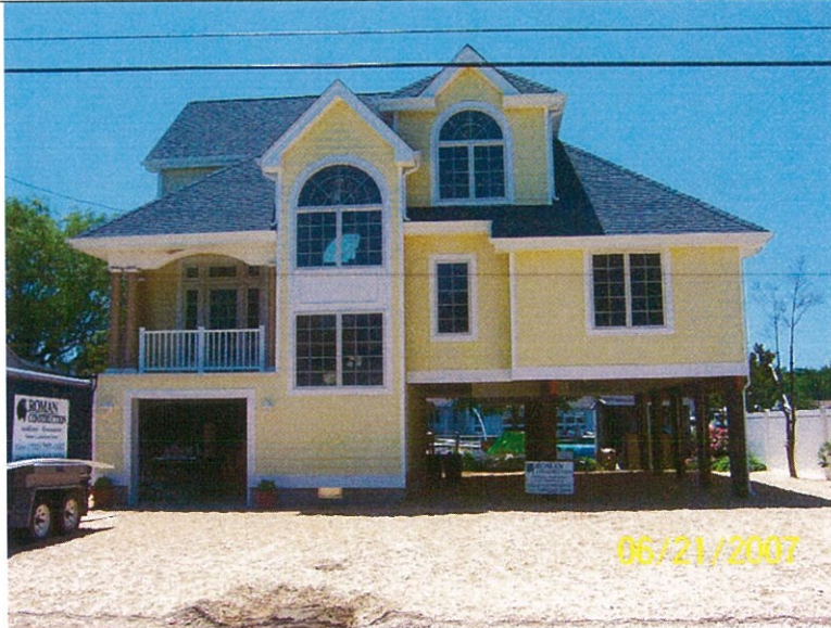
FRONT HOUSE No. 104

If using the Elevation Certificate to obtain NFIP flood insurance, affix at least two building photographs below according to the instructions for Item A6. Identify all photographs with: date taken; "Front View"; and if required, "Right Side View" and "Left Side View". If submitting more photographs that will fit on this page, use the Continuation Page, following.