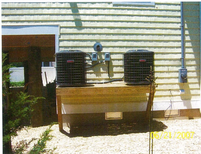
A.C. DECK, "SMART VENTS"